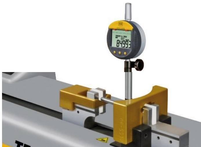
02160024 (dial gauge not included)