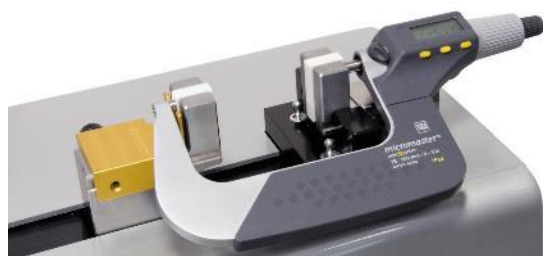
02160029 (micrometer not included)